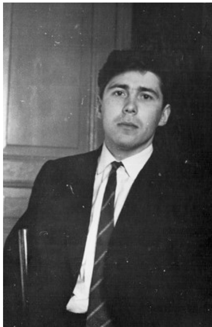
Fig. 2. L. P. Shilnikov in the 1960s.

heavily, and extending the theory to make it free from Poincaré–Bendixson-type arguments was a real challenge at the time. The first results were more or less the same as in 2D; the bifurcation of single, regular, isolated periodic orbits. Then, in January 1963, shortly after defending his PhD, the 28-year-old L. P. Shilnikov made his key discovery.